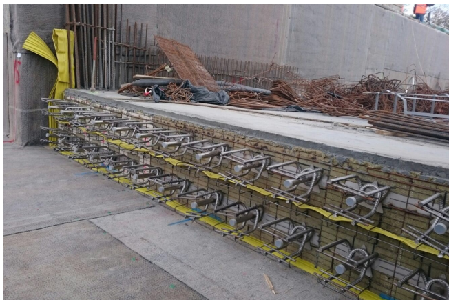
Formwork element with integrated shear force dowels