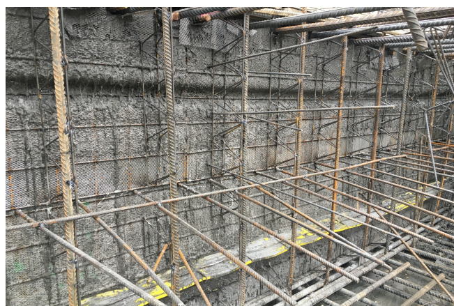
Stremaform® formwork elements for working joints