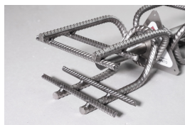
Shear force dowel Egcodorn®