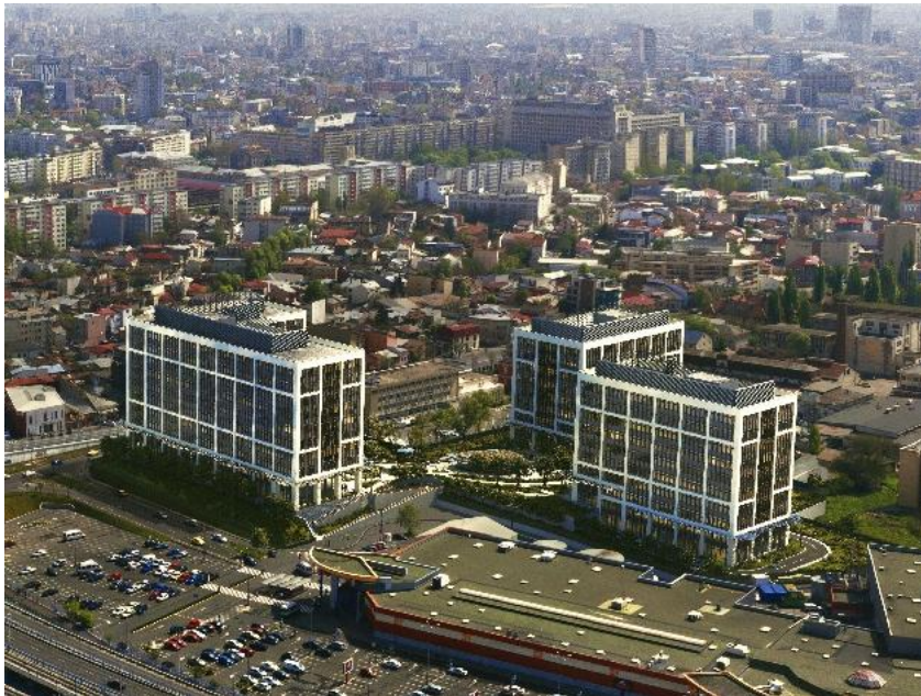
Business Garden Bukarest