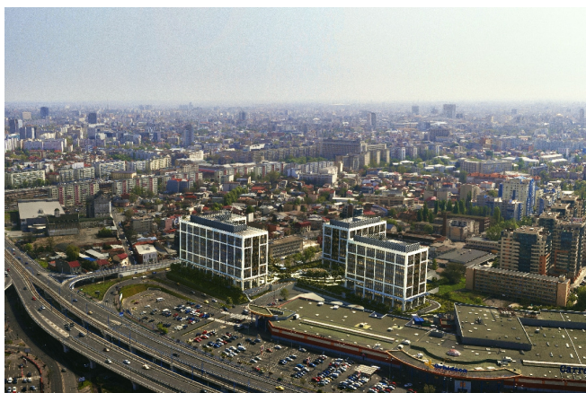
Business Garden Bucharest