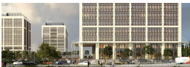
View of the three buildings