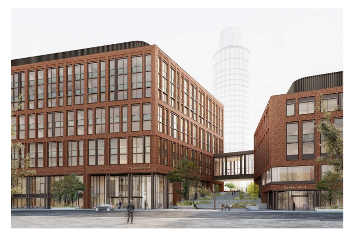
Danske Bank © Lundgaard & Tranberg Arkitekter