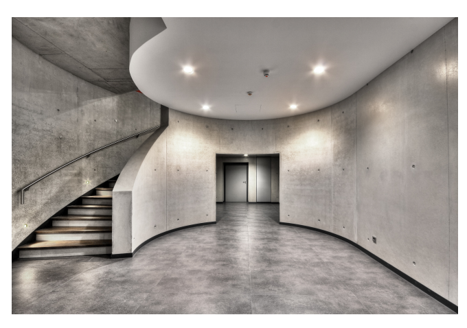
© dechant hoch- und ingenieurbau gmbh