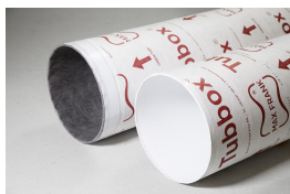
Column formers Tubbox®