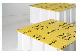
Ground heave solution Pecavoid®