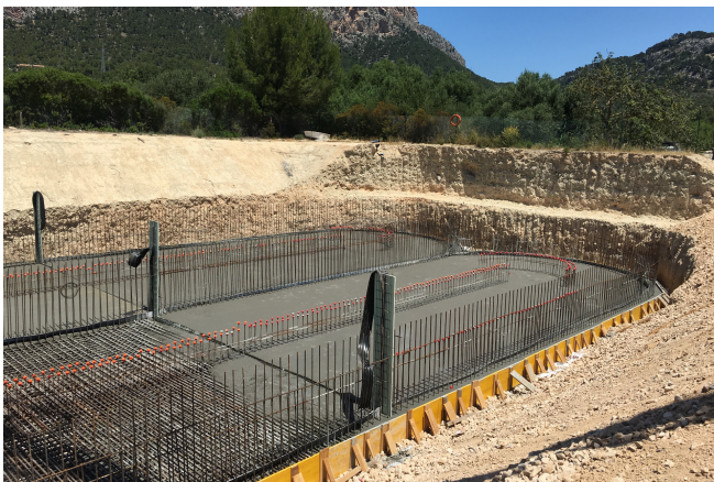
Concreting of the slab in one day