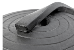
Expanding waterstop Cresco® BT