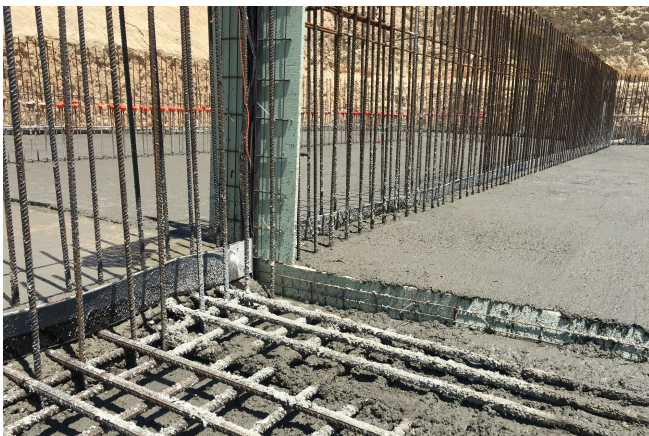
Formwork elements for expansion joints Stremaform® with rubber water bar cage