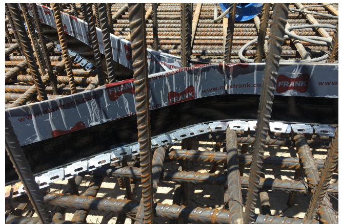
Metal water stop Fradiflex® in concrete working joints