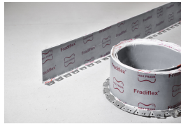
Metal waterstop Fradiflex®