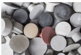
Fibre concrete sealing cones