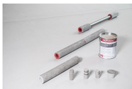
Fibre concrete distance tubes