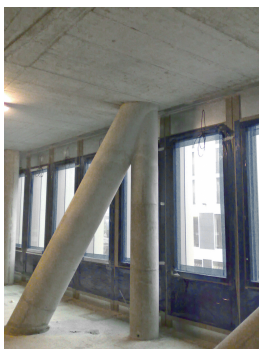
Column formers Tubbox® - custom shapes