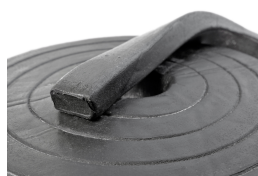
Expanding waterstop Cresco® BT