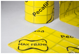
Permanent formwork Pecafile®