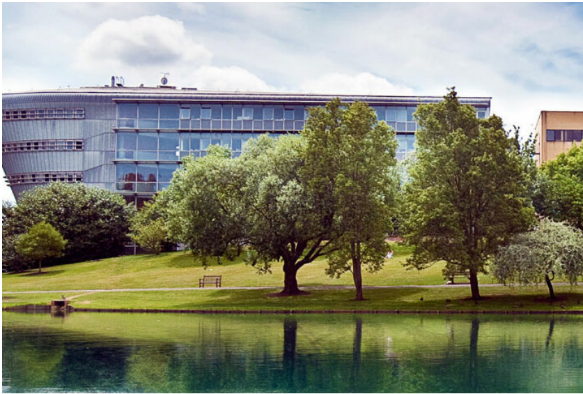
Universität Surrey