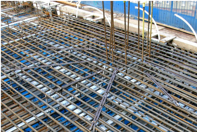
Shearail® installation