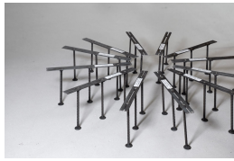
Punching shear reinforcement Shearail®