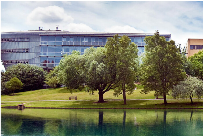
University of Surrey