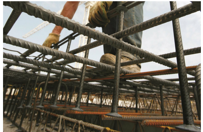
Shearail installation