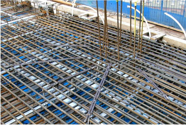
Shearail® installation