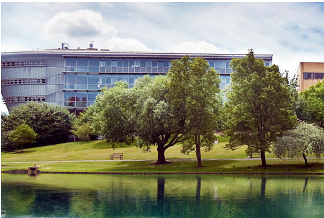
University of Surrey