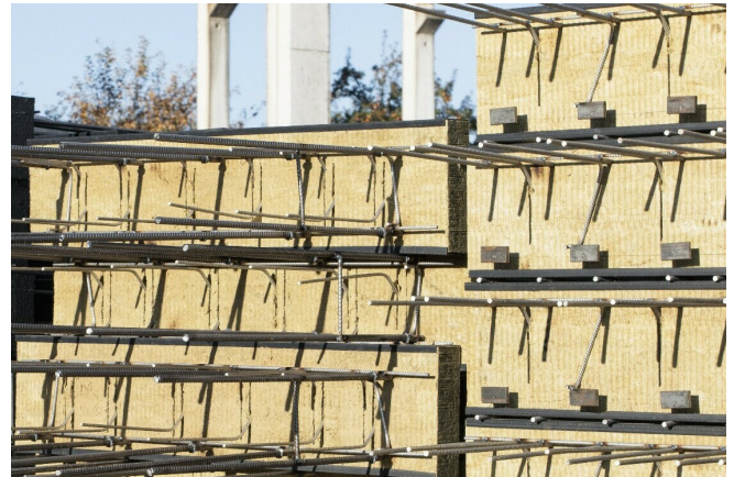
Egcobox® manufactured © www.maxfrank.com