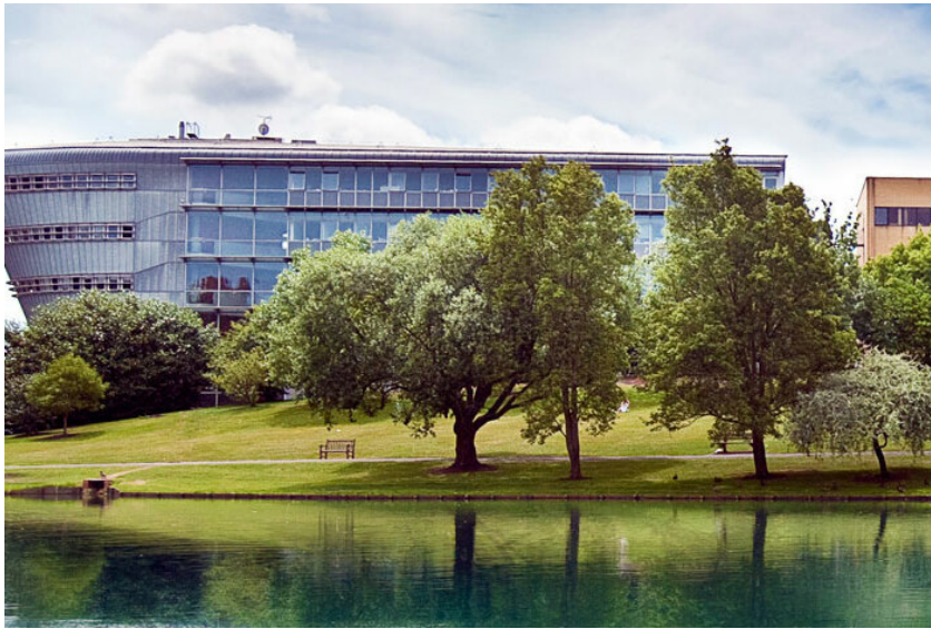
Universität Surrey