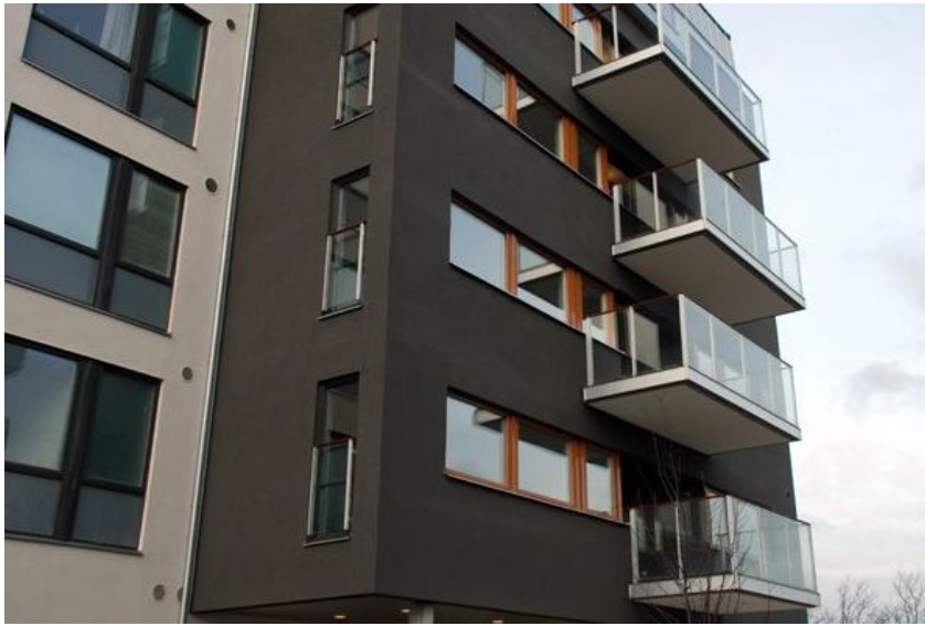
Victoria Park Malmö