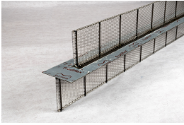
Stay-in-place formwork for working joints Stremaform®