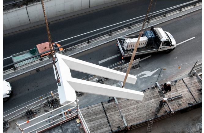
Design of the precast façade sections © www.maxfrank.com