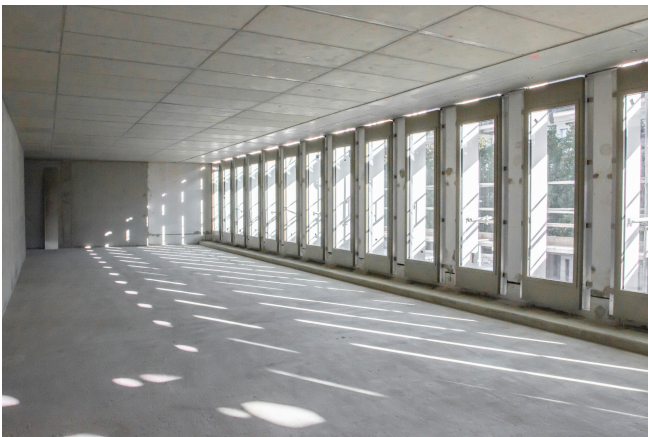
Column-free rooms thanks to load-bearing façade elements