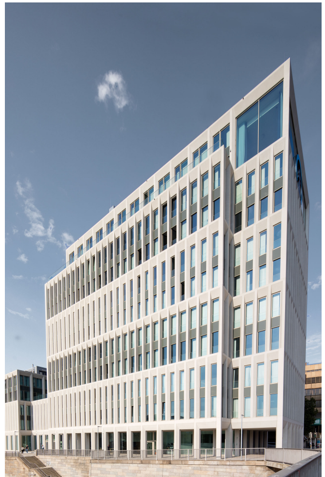
August-Kühne office