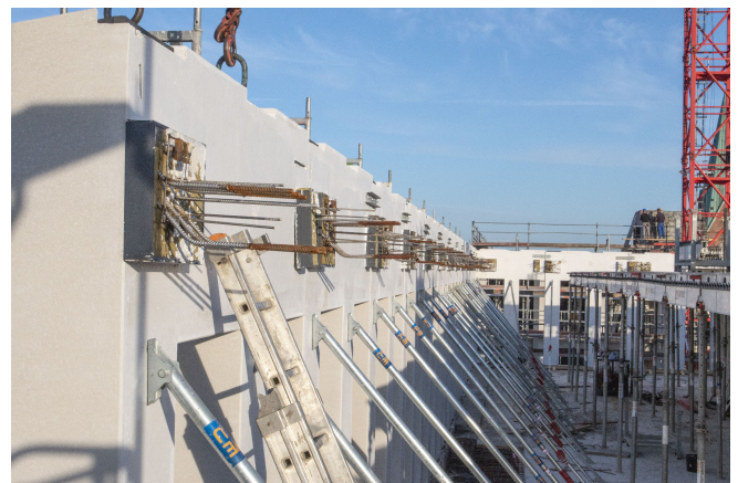
Shear force transmission on the façade section using Egccobox® thermally insulating connectors © www.maxfrank.com