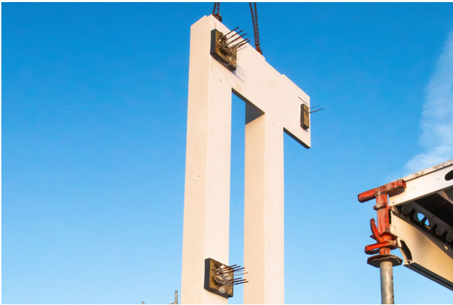
Design of the precast façade sections with insitu Egccobox® units