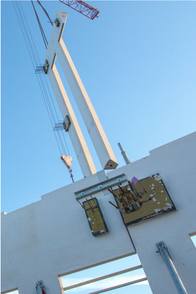
Shear force transmission on the façade element through Egobox® thermal isolating element