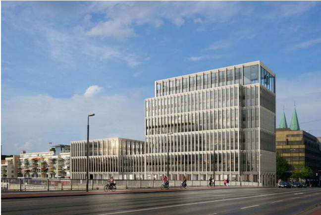
August-Kühne-Haus administration building © Cube Visualisierungen