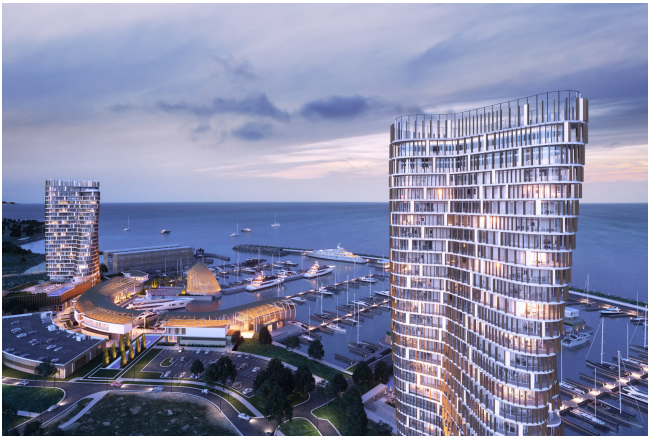
Ayia Napa Marina building