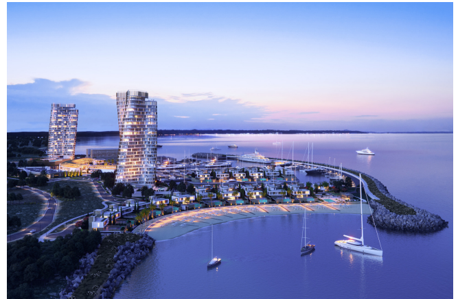
Ayia Napa Marina building