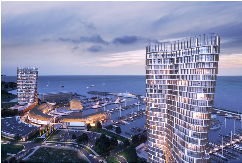
Ayia Napa Marina Bauwerk

For the construction of this project consisting of two towers, MAX FRANK Coupler threaded connection was delivered.