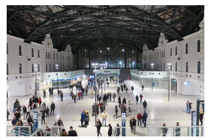
station concourse © Travelarz, Łódź Fabryczna - hol dworca (1), CC BY-SA 3.0 PL