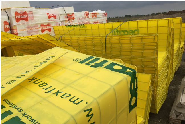
Permanent formwork Pecafil® and ground heave solution Pecavoid®