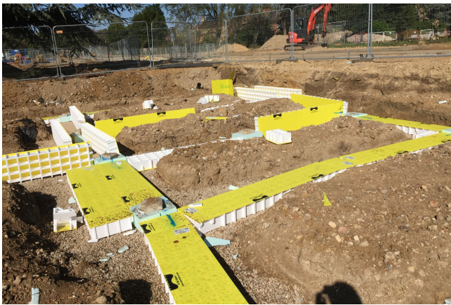
Ground heave solution Pecavoid®