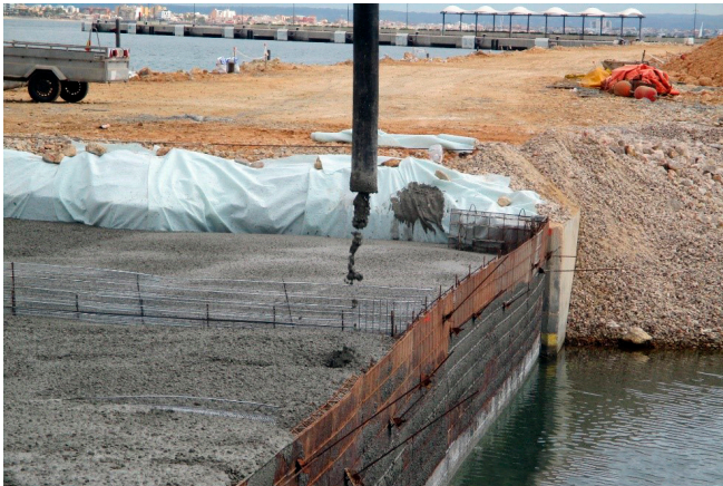
Last concreting process