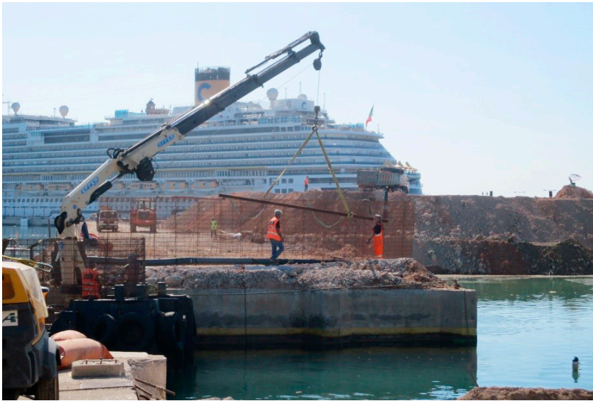
Platzierung der Abstellelemente mit herkömmlichen Hebemitteln