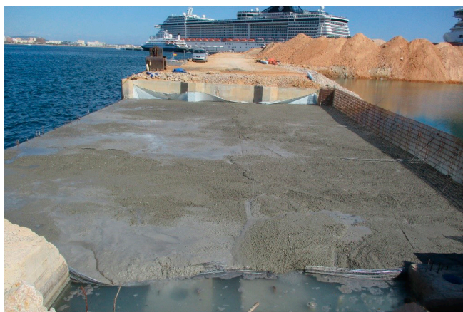
Concreting against prefabricated caissons