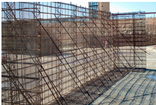
Stremaform® formwork elements in L shape