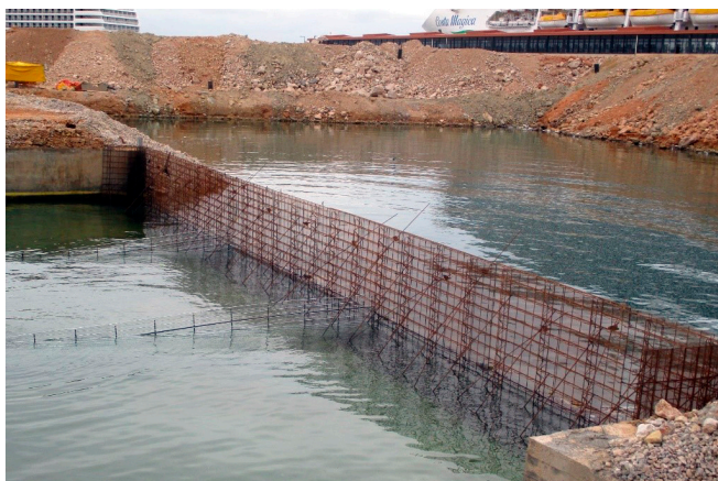
Formwork elements Stremaform® for underwater concreting