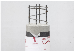
Column formers Tubbox® - blowhole-free finish