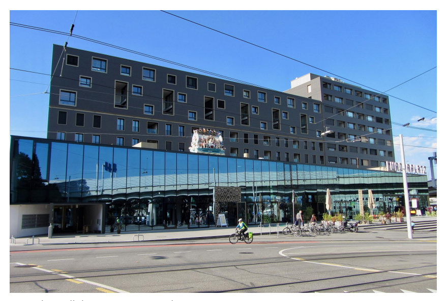
Haus der Religionen am Europaplatz