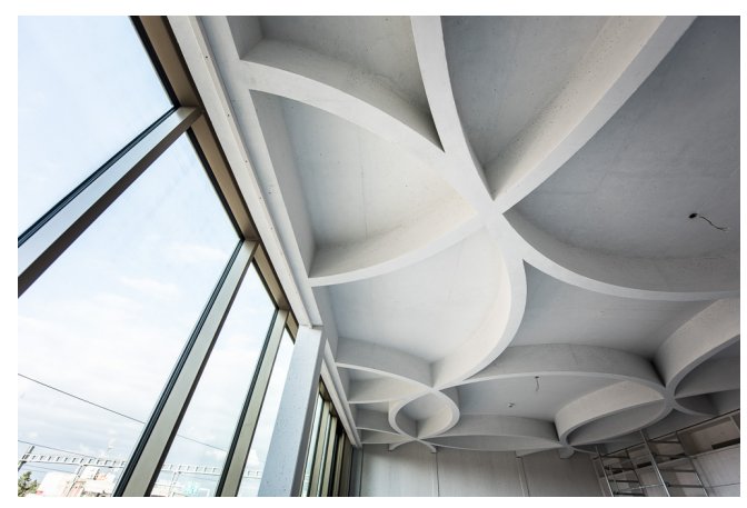
Decorative ceiling realised with shaping formwork {\tt Fratec}