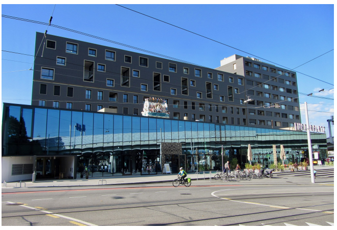
House of religions at Europaplatz in Bern