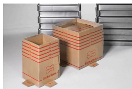
Box-out shutters and recess formers