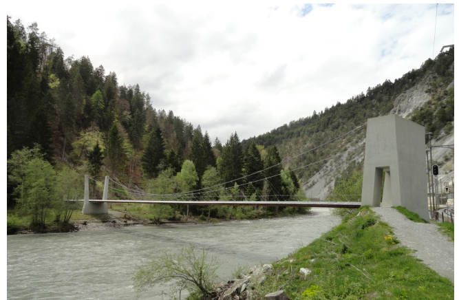
© own work, Punt Ruinaulta von Osten, CC BY-SA 3.0