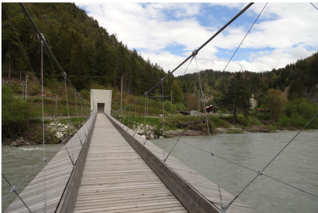
© own work, Punt Ruinaulta nach Norden, CC BY-SA 3.0