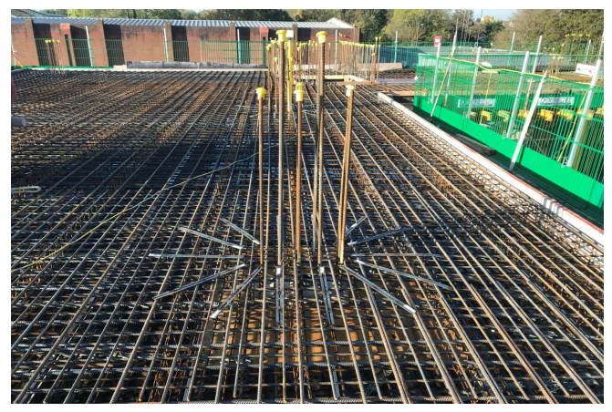
Richmond Upon Thames College - Shearail \ensuremath{\$} \ensuremath{\mathbb{C}} www.maxfrank.com