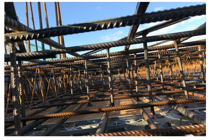
Richmond Upon Thames College - Shearail \ensuremath{\$} \ensuremath{\mathbb{C}} www.maxfrank.com