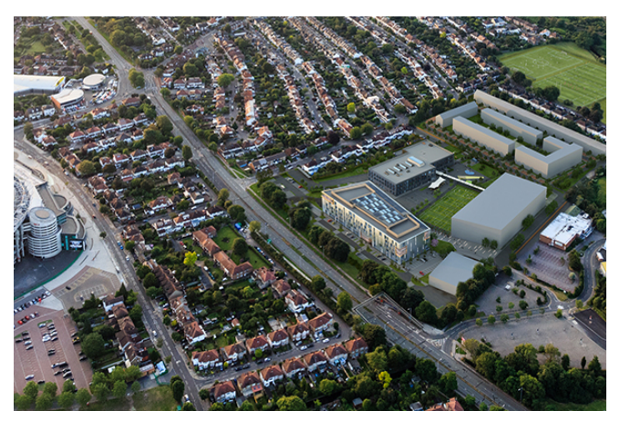
Richmond Upon Thames College - Shearail \ensuremath{\$} \ensuremath{\mathbb{C}} Atkins Global