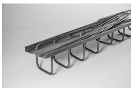
Continuity strip Stabox®