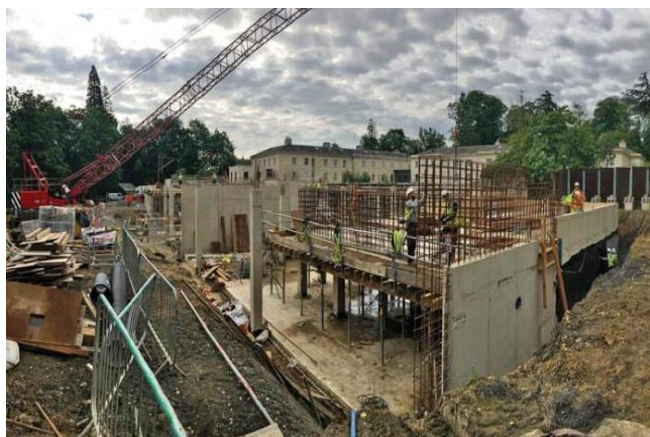
© Karakusevic Carson Architects and Higgins Construction