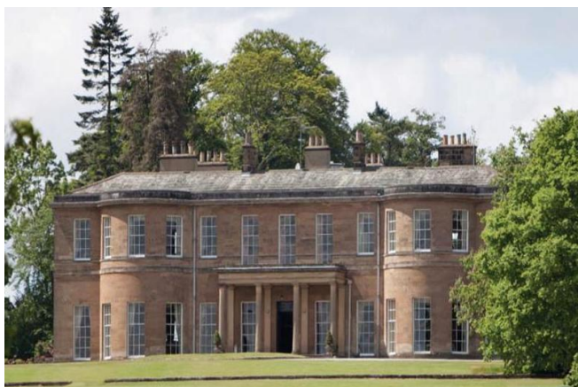
© Karakusevic Carson Architects and Higgins Construction