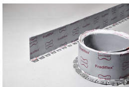
Metal waterstop Fradiflex®