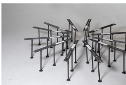
Punching shear reinforcement Shearail®