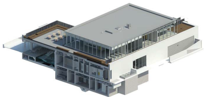
© Karakusevic Carson Architects and Higgins Construction