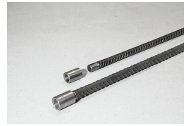
Threaded connection MAX FRANK Coupler