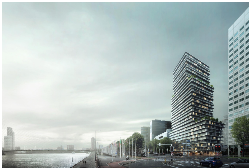
The Terraced Tower

For the construction of this high-rise residential building MAX FRANK Coupler threaded connection was delivered.