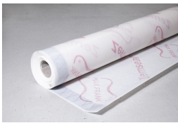
Sub-structure waterproofing system Zemseal®