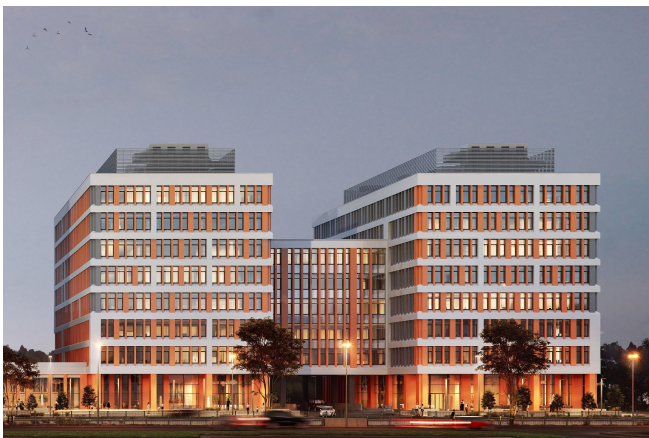
Timpuri Noi Square