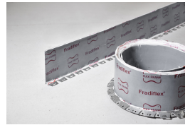
Metal waterstop Fradiflex®