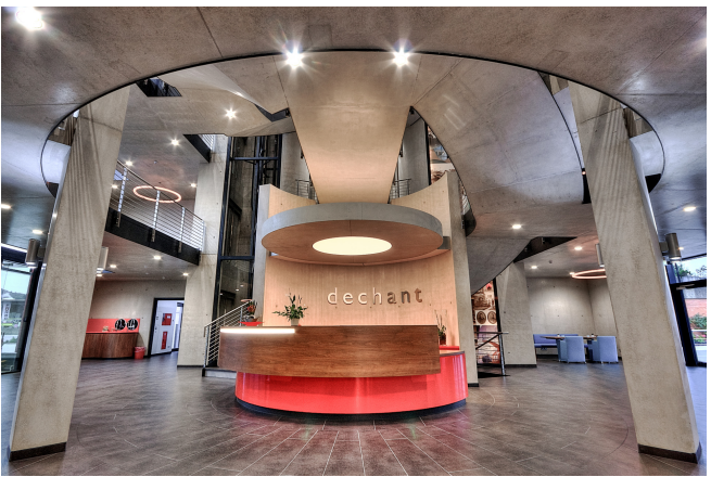
© dechant hoch- und ingenieurbau gmbh © dechant hoch- und ingenieurbau gmbh