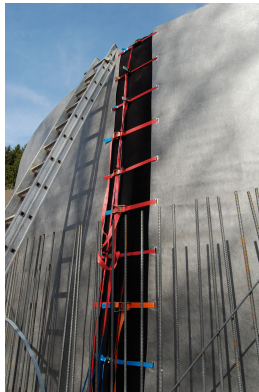
CPF liner Zemdrain® Classic - prefabricated