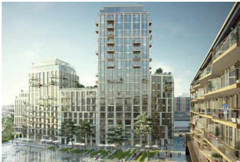
Illustration Fortress Wapping, London Dock