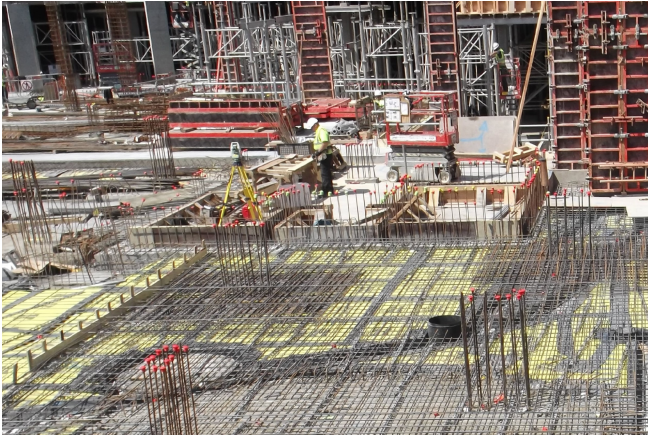
Ground heave solution Pecavoid®