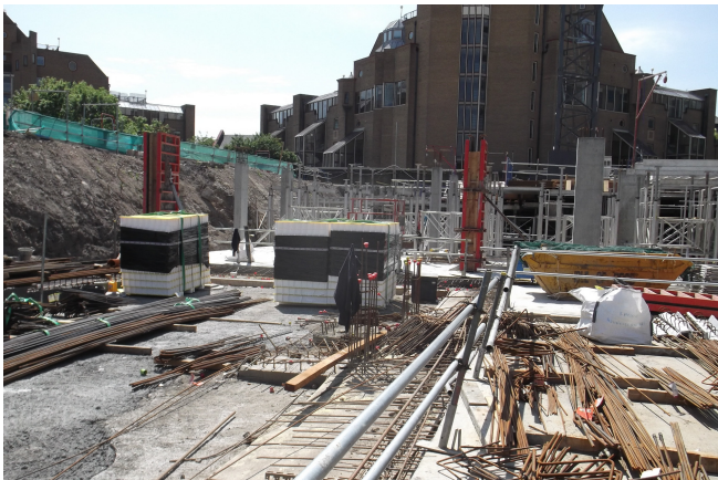
Ground heave solution Pecavoid®