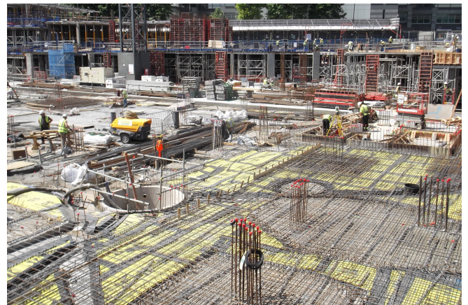
Ground heave solution Pecavoid® © www.maxfrank.com