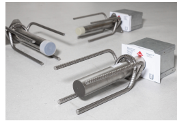
Impact sound insulated shear force dowels Egcopal