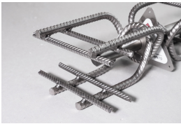
Shear force dowel Egcodorn®