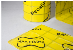
Permanent formwork Pecafile®