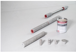
Fibre concrete distance tubes