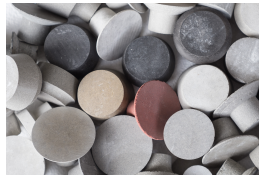
Fibre concrete sealing cones