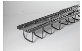
Continuity strip Stabox®