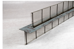
Stay-in-place formwork for working joints Stremaform®