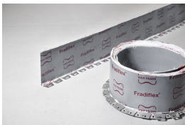
Metal waterstop Fradiflex®