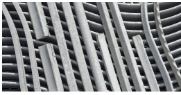
Fibre concrete bar spacers