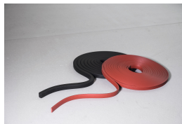
Expanding waterstop Cresco®