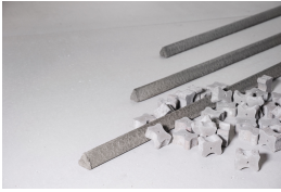
Fibre concrete spacers