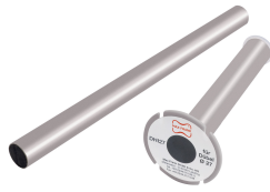
Shear force dowel Egcodubel