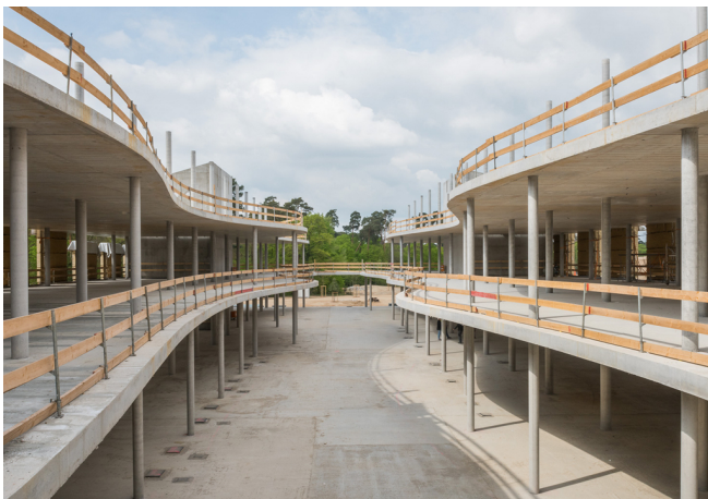
Tubbox® column formers and Sorp 10® absorber already stripped.