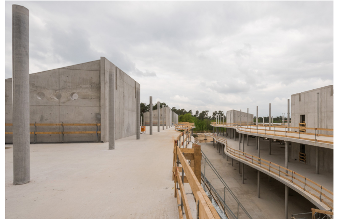
Exposed concrete finish