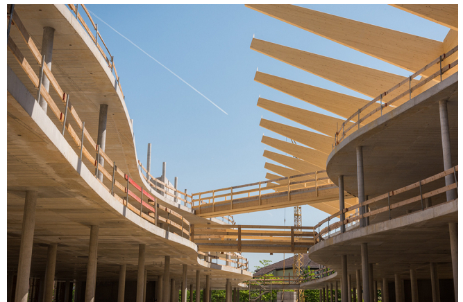
Concrete core activated components with Sorp 10®