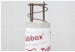
Column formers Tubbox® – smooth finish