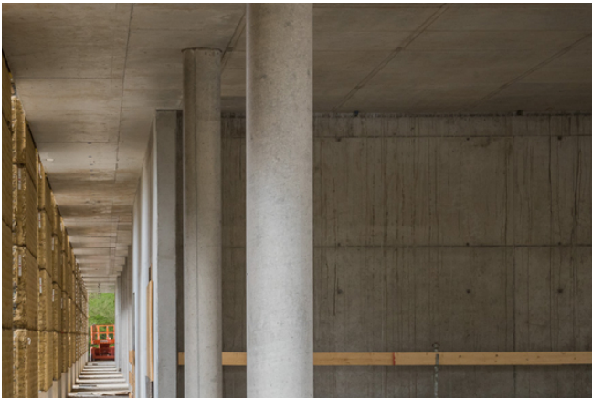
Smooth finish mit Tubbox® column formers