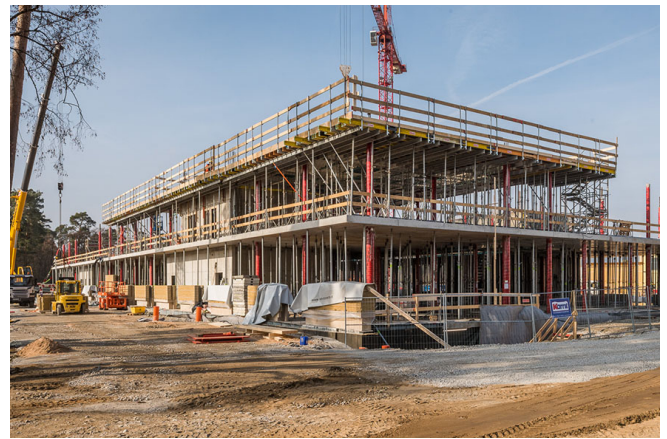
Two floors with Tubbox® circular columns