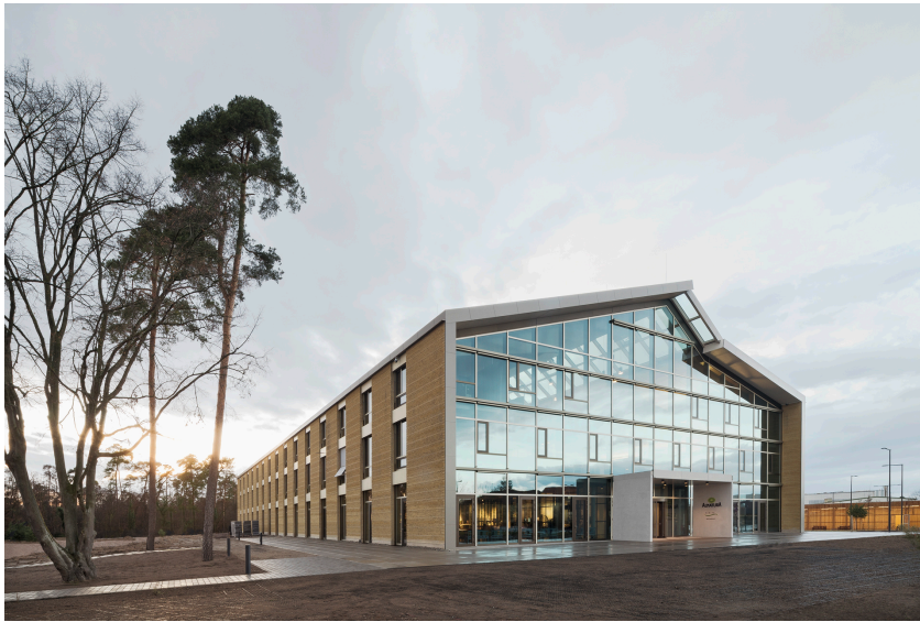
Arbeitswelt von Alnatura in Darmstadt

With the Alnatura working world, an architectural milestone has been reached in terms of sustainability, material efficiency, openness and modern working methods arose.