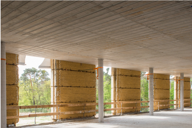
Rammed clay technique and concrete core temperature control