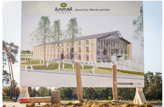
Sustainability - largest clay building in Europe