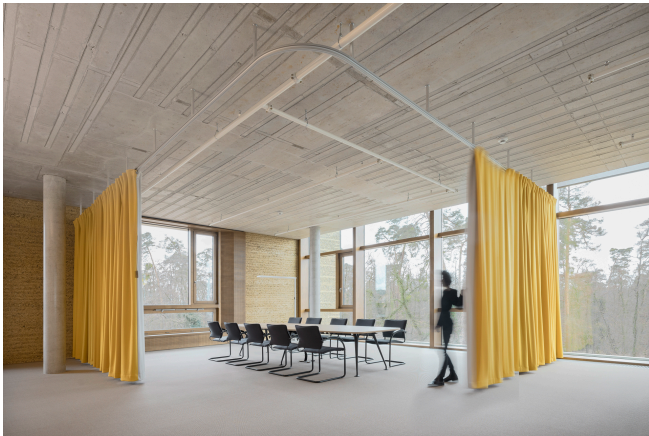
Open meeting rooms furnished with Sorp 10®