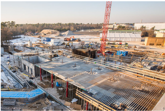
Raw building with Tubbox® and Sorp 10®