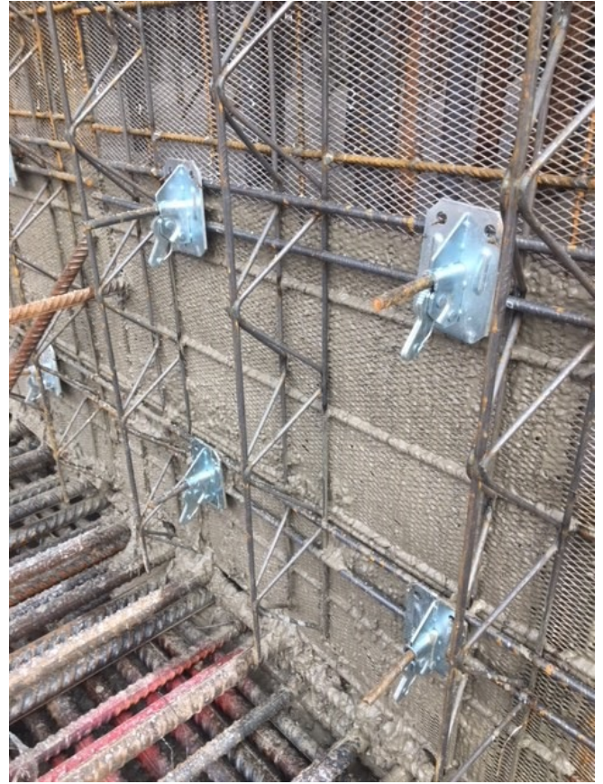
Stremaform® supplied to Anthology Hale Works