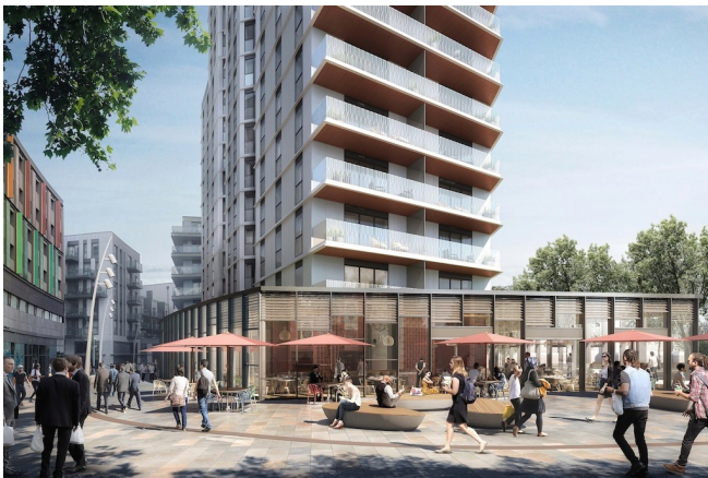
Anthology Hale Works