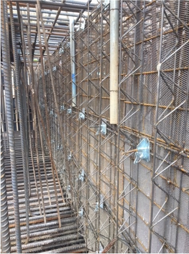
Stremaform® supplied to Anthology Hale Works