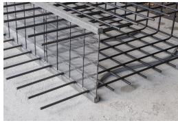
Stay-in-place formwork for working joints Stremaform®