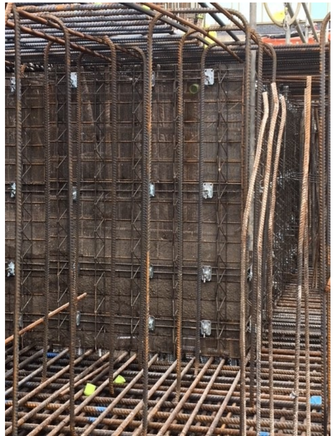
Stremaform® supplied to Anthology Hale Works © www.maxfrank.com