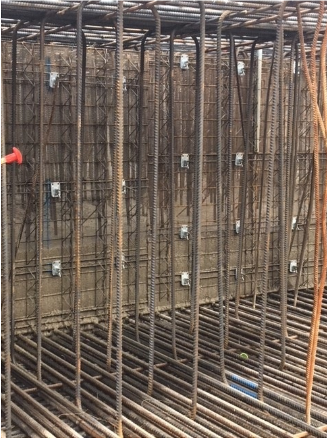
Stremaform® supplied to Anthology Hale Works © www.maxfrank.com