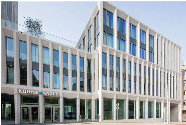
August-Kühne office © August-Kühne-Haus