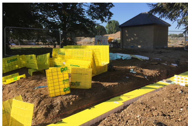
Permanent formwork Pecafile® and ground heave solution Pecavoid®