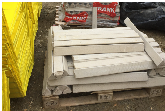
Fibre concrete spacers