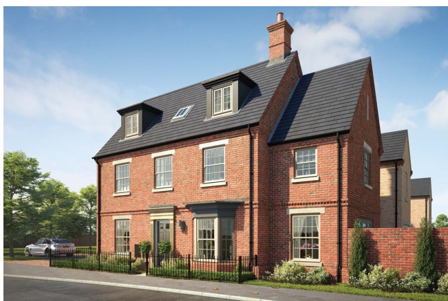
Computer generated image of The Whitworth house type