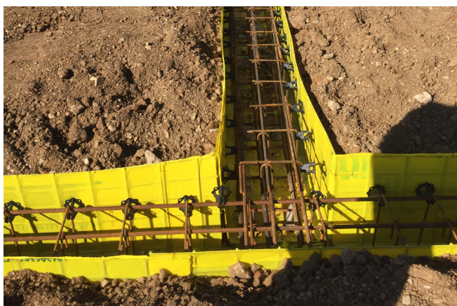
Permanent formwork Pecafile®