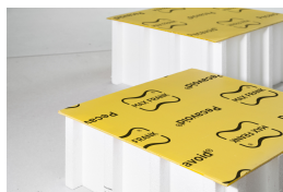
Ground heave solution Pecavoid®