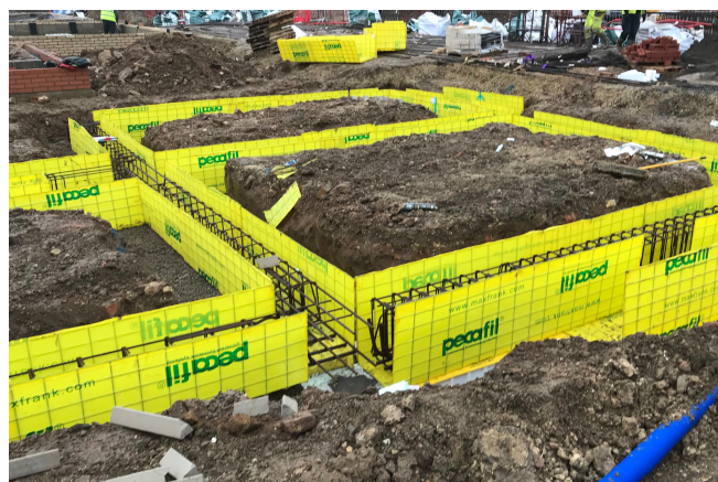
Permanent formwork Pecafile®