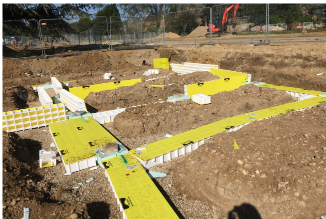
Ground heave solution Pecavoid®