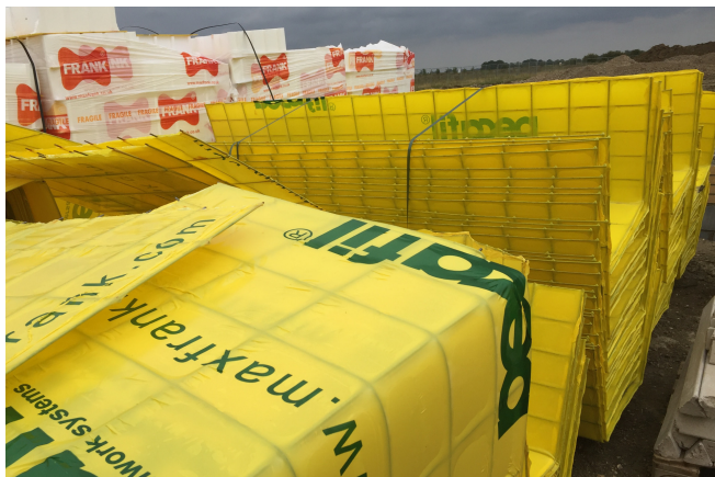
Permanent formwork Pecafil® and ground heave solution Pecavoid®