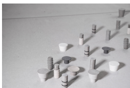
Sealing cones and plugs