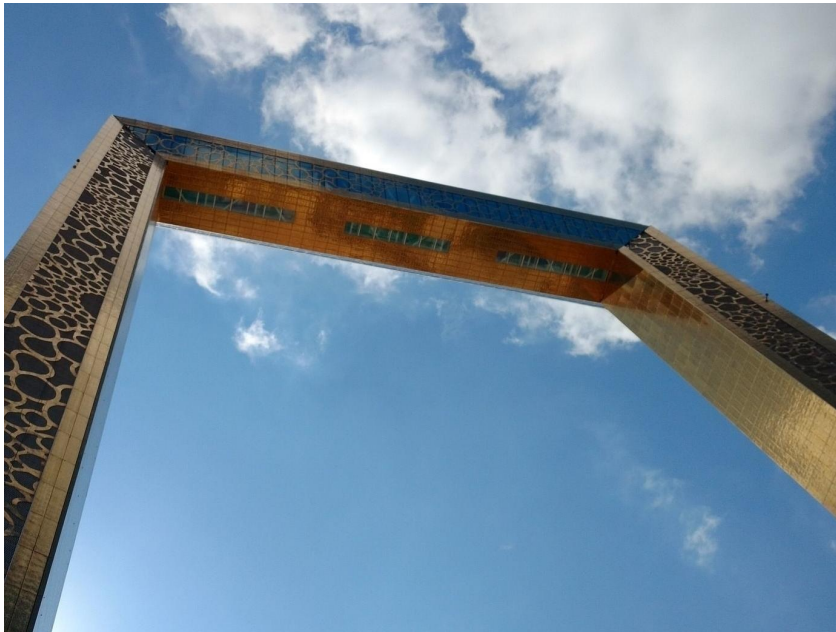
Dubai Frame