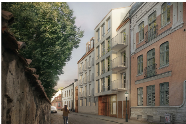
Kulturkvadranten Sankt Mikael © FOJAB Arkitekter