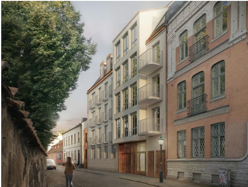
Kulturkvadranten Sankt Mikael © FOJAB Arkitekter