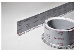
Metal waterstop Fradiflex®