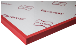
Void former Egcovoid® - floor slab / foundation