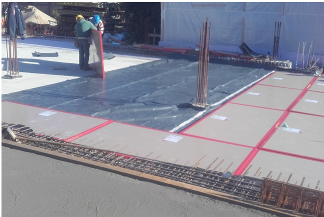
Installation of the Egcovoid® void former