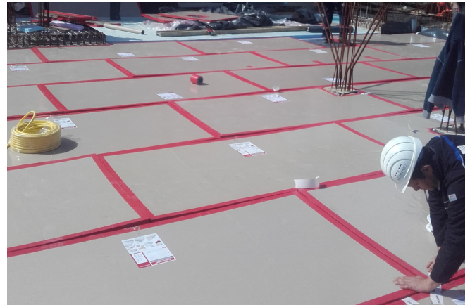
Installation of the Egcovoid® void former