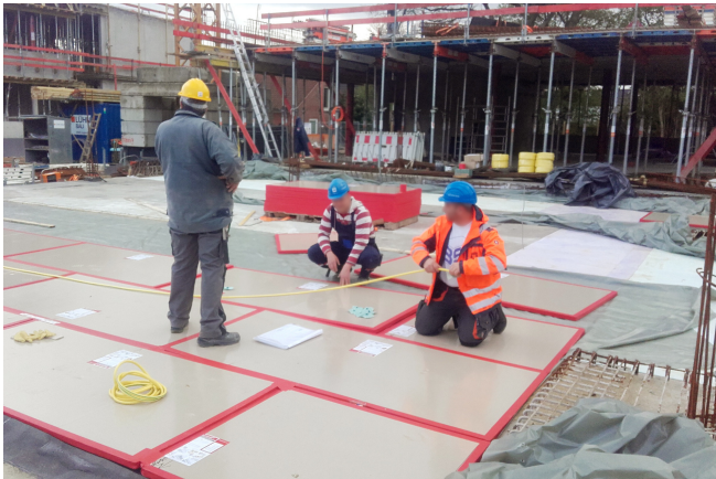
Installation of the Egcovoid® void former