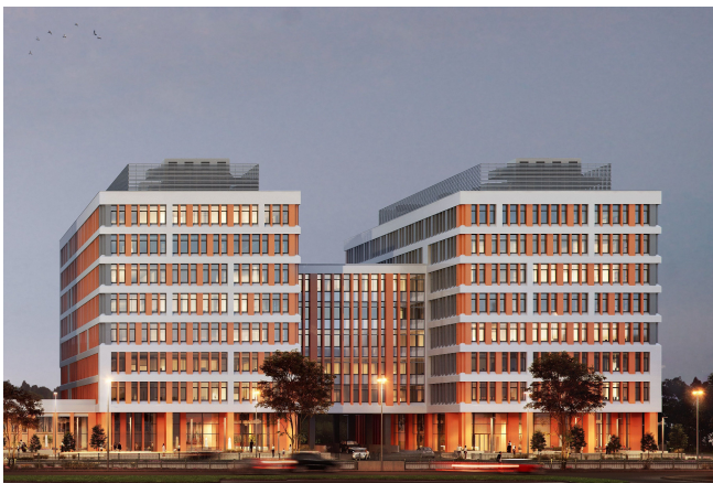
Timpuri Noi Square