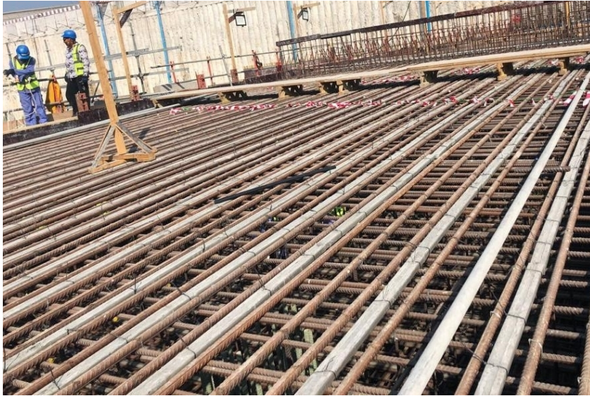
Mina Tunnel Abu Dhabi - Baustelle