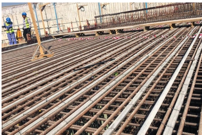
Site Mina Tunnel Abu Dhabi