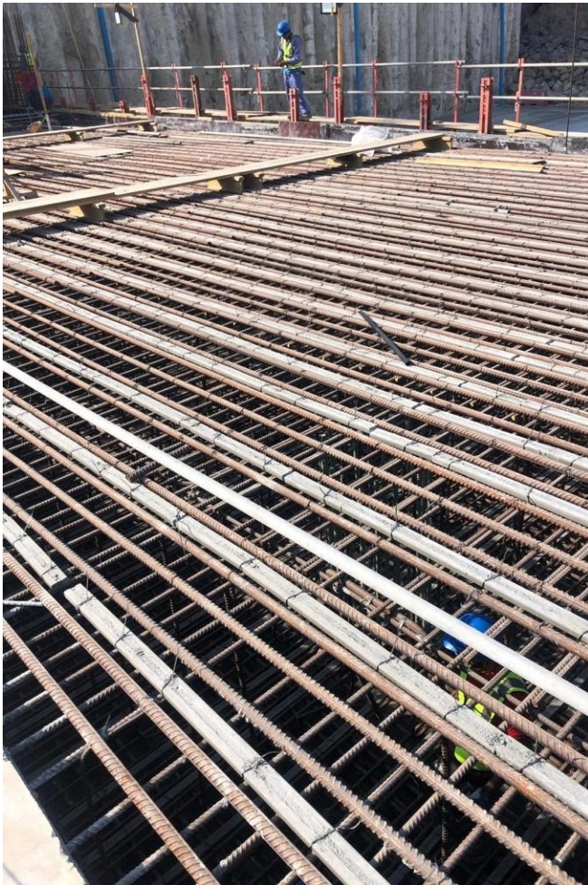
Site Mina Tunnel Abu Dhabi