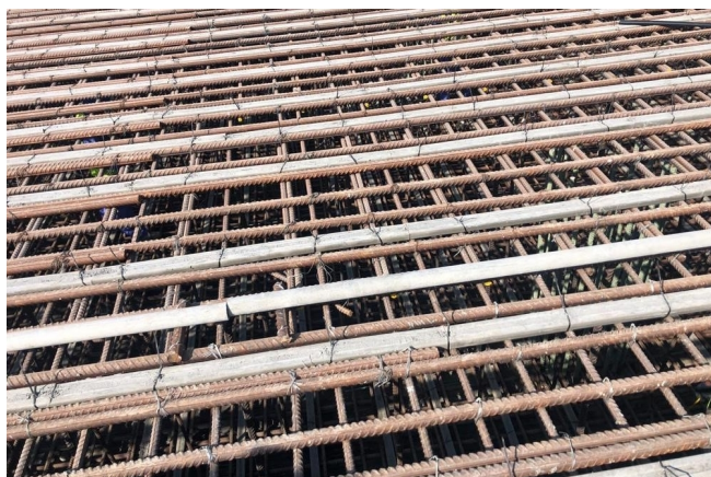
Site Mina Tunnel Abu Dhabi