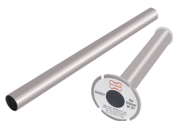
Shear force dowel Egcodubel