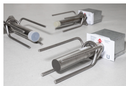
Egcopal trinlydisolert forskydningskraftdyvel