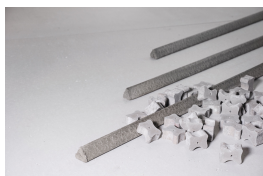
Afstandsholder af fiberbeton