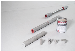
Afstandsrør af fiberbeton