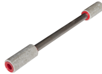
Combined shutter tie