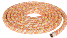
Intec® Cem N injektionsslangesystem