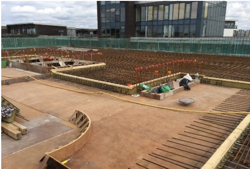
Kragplattenanschluss Egccobox®