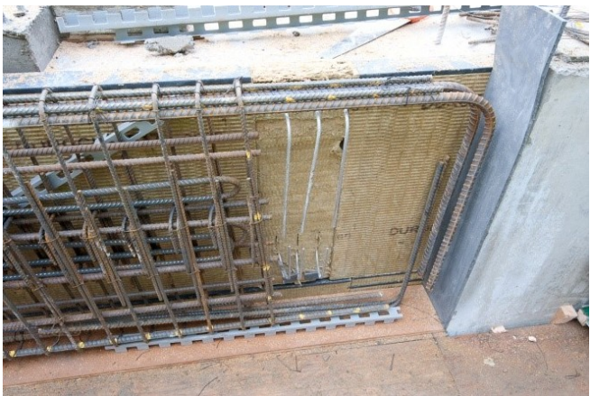
Thermal break balcony connector Egcobox®