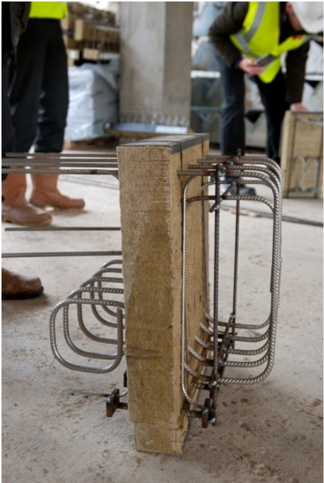
Thermal break balcony connector Egcobox®