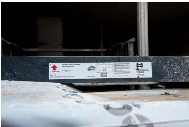
Thermal break balcony connector Egcobox®