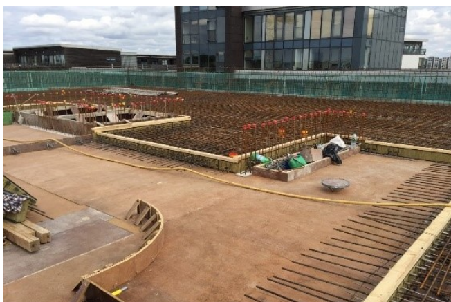
Thermal break balcony connector Egcobox®