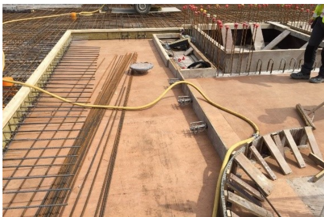
Thermal break balcony connector Egcobox®