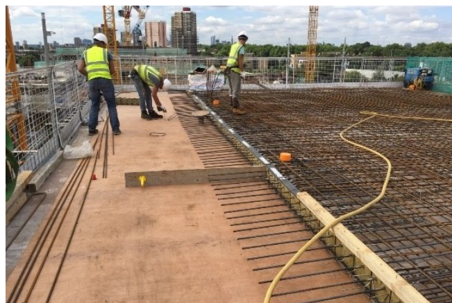
Thermal break balcony connector Egcobox®