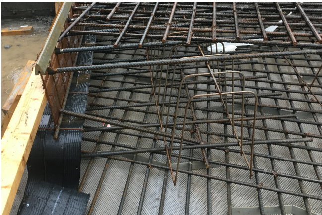
Installation of formwork element Stremaform®