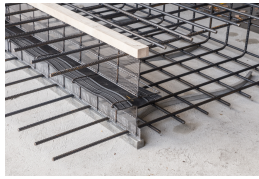
Formwork elements for working joints Stremaform® with rubber water bar cage