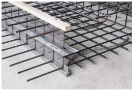
Formwork elements for working joints Stremaform® with coated metal water stop