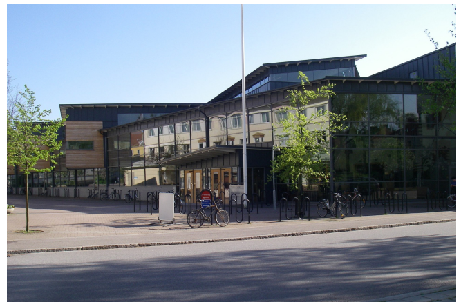
Linnaeus University library