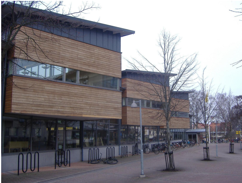
Bibliotheksgebäude der Linnaeus Universit t

  Nastoshka, Universit  di Kalmar-biblioteca, CC BY-SA 3.0