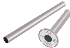
Shear force dowel Egcodubel