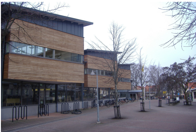
Linnaeus University library