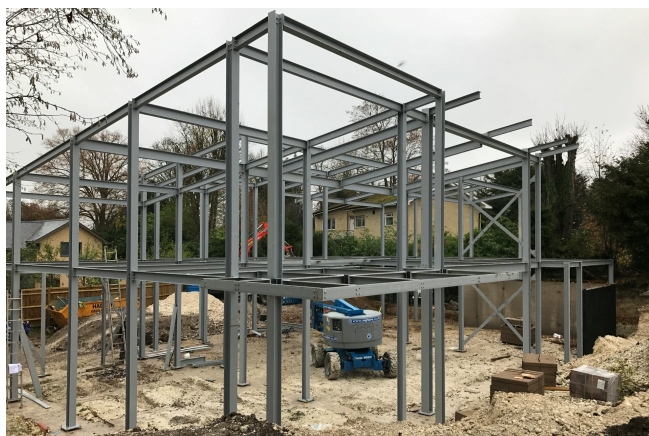
Residential building with Egcobox® FST