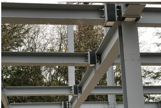
residential build egcobox fst