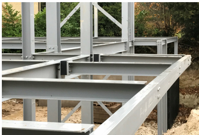
Residential building with Egcobox® FST