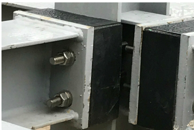
residential build egcobox fst