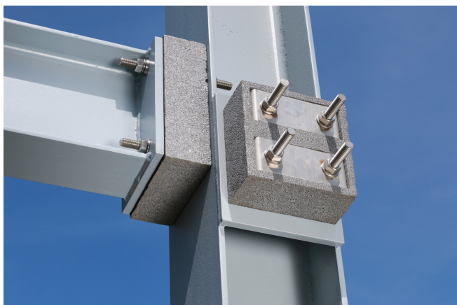
Residential building with Egcobox® FST