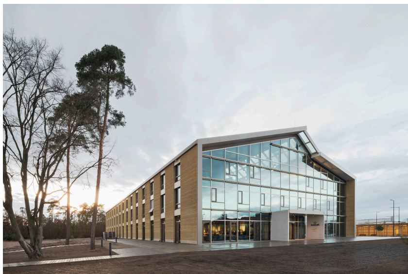
Arbeitswelt von Alnatura in Darmstadt

With the Alnatura working world, an architectural milestone has been reached in terms of sustainability, material efficiency, openness and modern working methods arose.