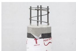
Column formers Tubbox® - blowhole-free finish