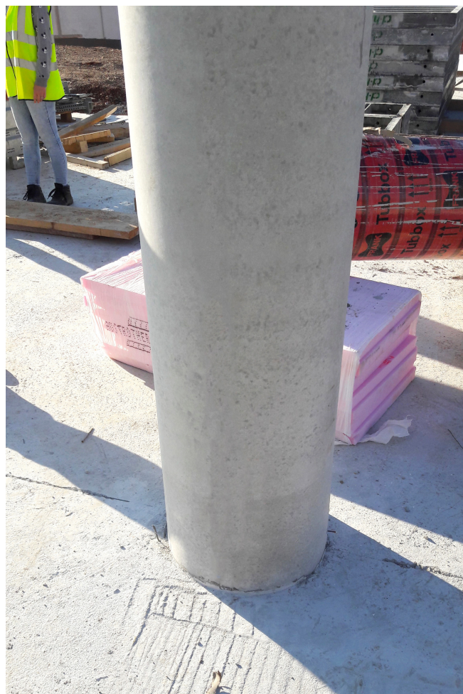
Column formers Tubbox® - blowhole free finish