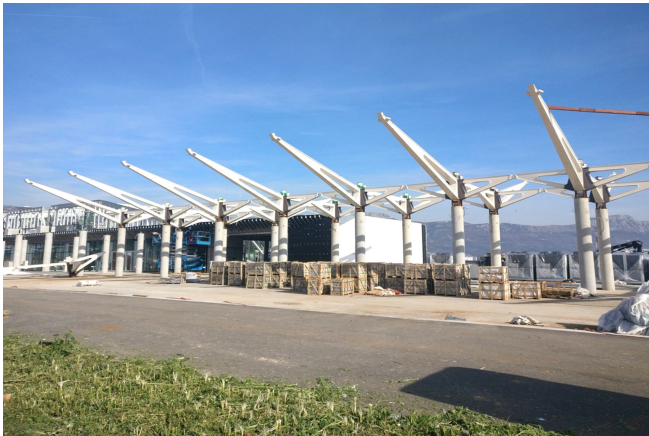
Column formers Tubbox® - blowhole free finish