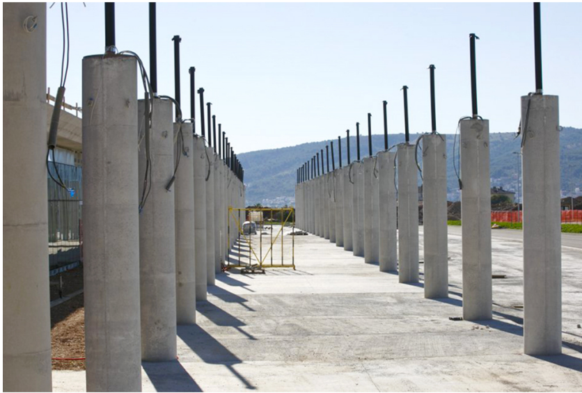
Schalrohr Tubbox® Oberfläche lunkerfrei