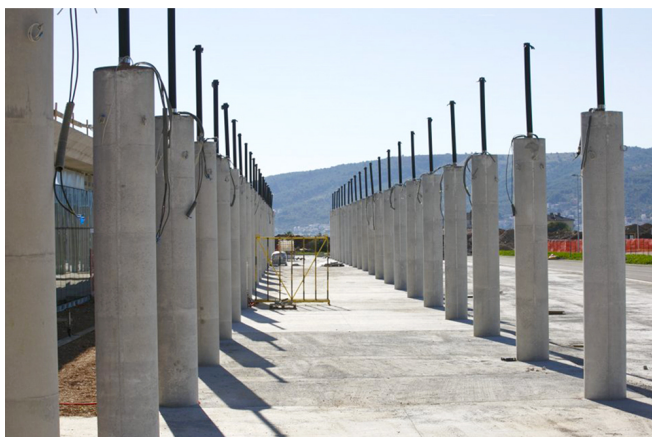
Column formers Tubbox® - blowhole free finish